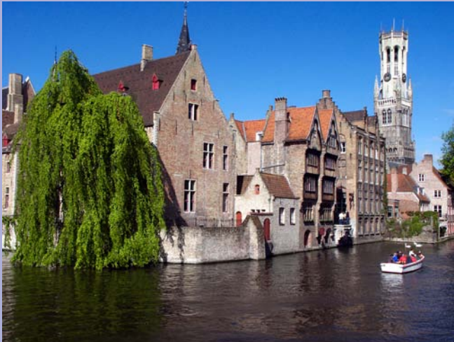
City of Brugge - Canal Rozenhoedkaai