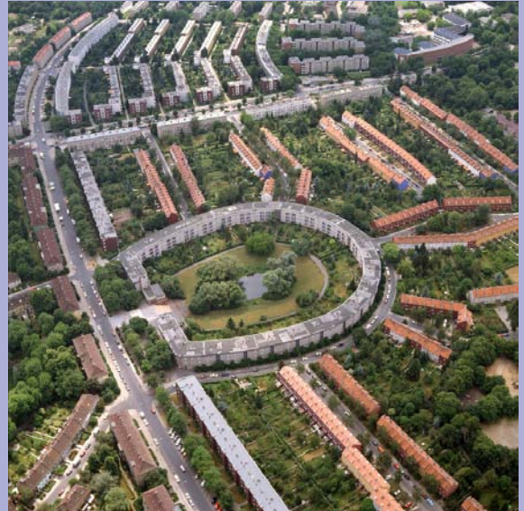
City of Berlin - Aerial view of the Modernist Housing Estates

State.” Article 5 stipulates that each State Party to this Convention shall endeavour, in so far as possible, and as appropriate for each country, to adopt a general policy which aims to give the cultural and natural heritage a function in the life of the community and to integrate the protection of that heritage into comprehensive planning programmes. Over and above that, appropriate legal, scientific, technical, administrative and financial measures necessary for the identification, protection, conservation, presentation and rehabilitation of this heritage are to be taken. It is left to each State Party of this Convention to decide what administrative and legal arrangements are made for the protection of the World Heritage.