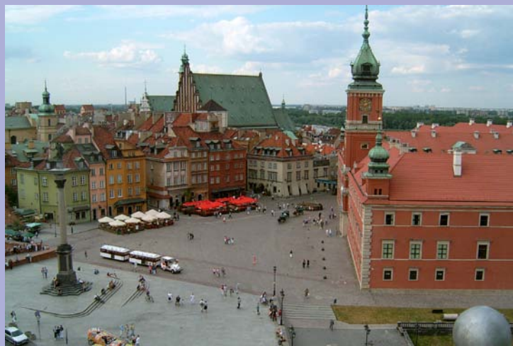
City of Warsaw - Royal Castle Square