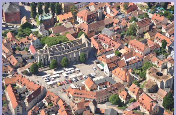
City of Visby