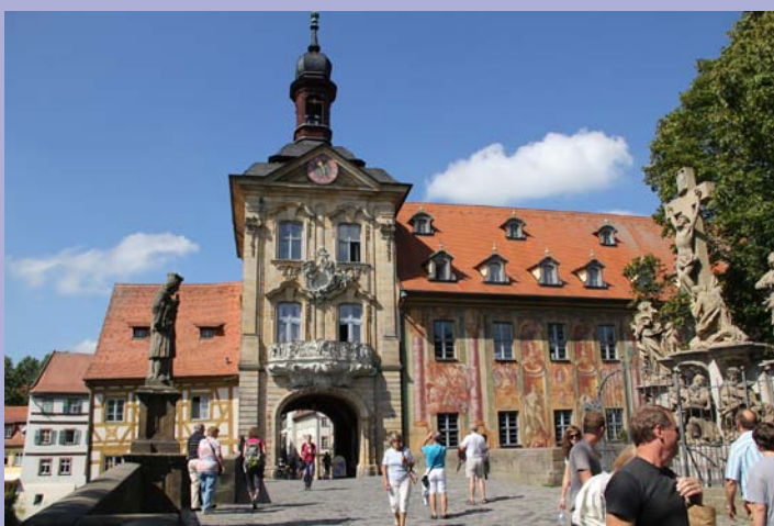
City of Bamberg - Old Town Hall