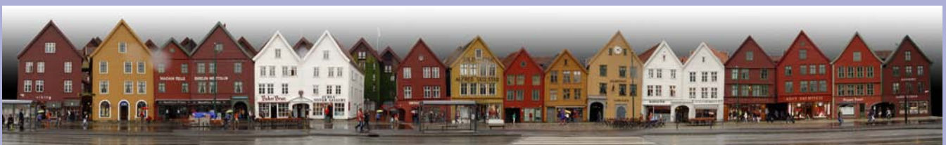
City of Bergen - Old Brygge Buildings