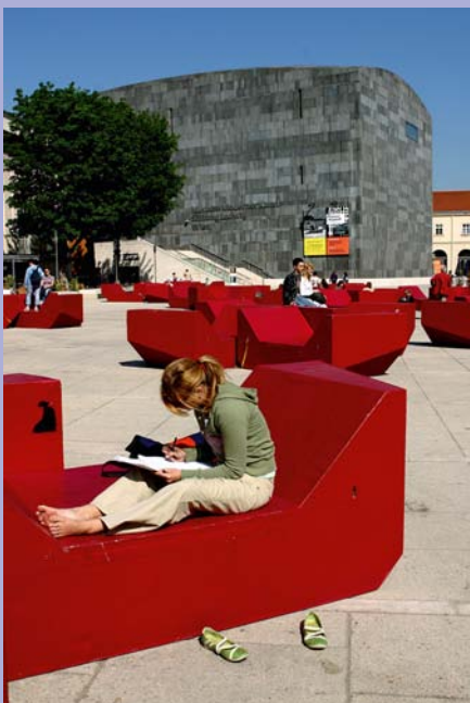
City of Vienna - Museumsquartier

1. Quality of life and World Heritage designation : (soft) location factor.