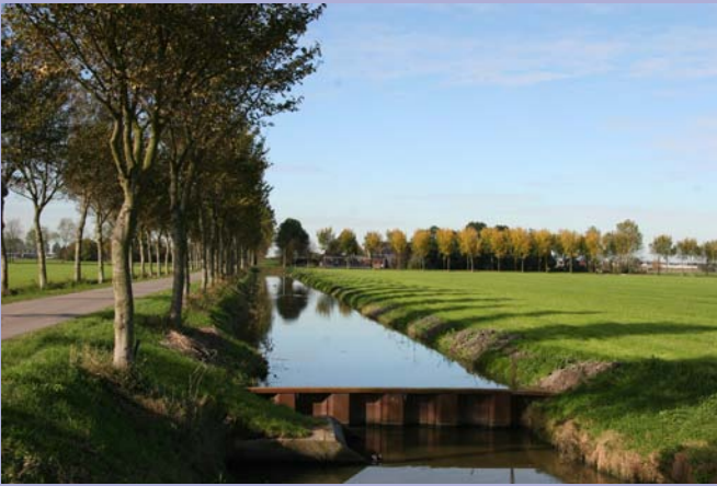
City of Beemster