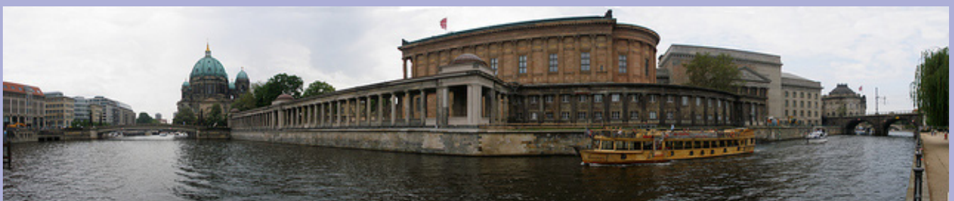
City of Berlin - Museumsinsel Panorama