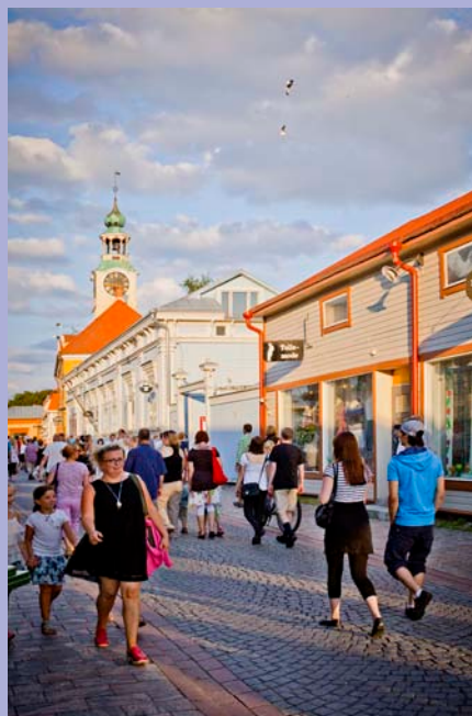
City of Rauma