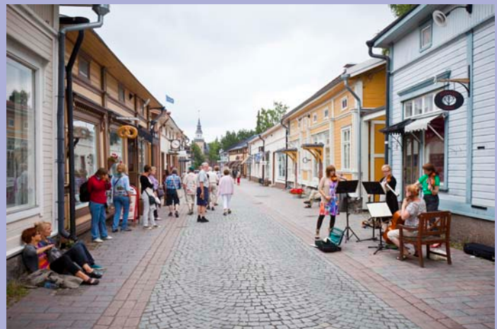
City of Rauma