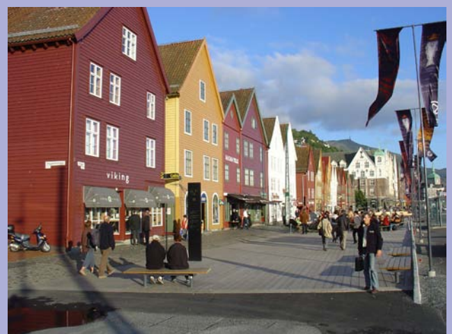
City of Bergen - Bryggen