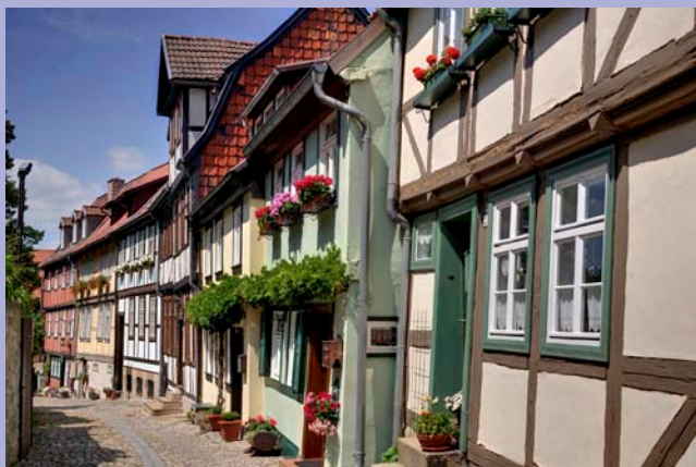
City of Quedlinburg - Schloßberggasse