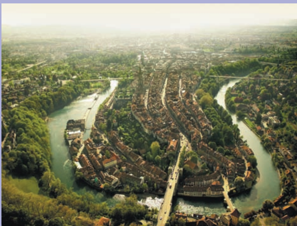
City of Bern

Demographic change due to an ageing population can cause serious issues in historic towns, such as vacant buildings, usage changes, and either alterations or adjustments to infrastructural and transportation systems. In contrast, many regions are anticipating an increase in their populations. These changes continue to grow and impact how municipalities direct their housing plans, how healthcare is managed, or even how commercial districts can be compatible with World Heritage status. In the 21st century, towns must be readily adaptable to the pressures put on by changing societal activities. Particularly in UNESCO World Heritage Cities, the requirements to secure “Outstanding Universal Value” (OUV) over the long term have increased. Safeguarding this mark of distinction is not just an honourable commitment, but a shared responsibility. This responsibility requires an integrated approach that involves all stakeholders (i.e. citizens, property owners, economists, and administrators), to discuss appropriate strategies and measures. It follows that towns be participatory with their partners in anchoring and developing the World Heritage concept, and in protecting sites over the long term. In particular they should reach all generations.