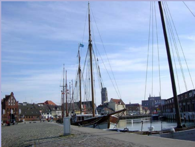
City of Wismar - Harbour