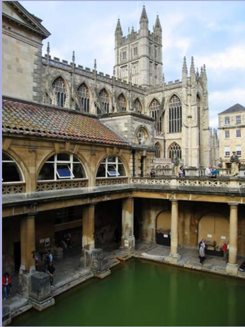
City of Bath - Roman Baths