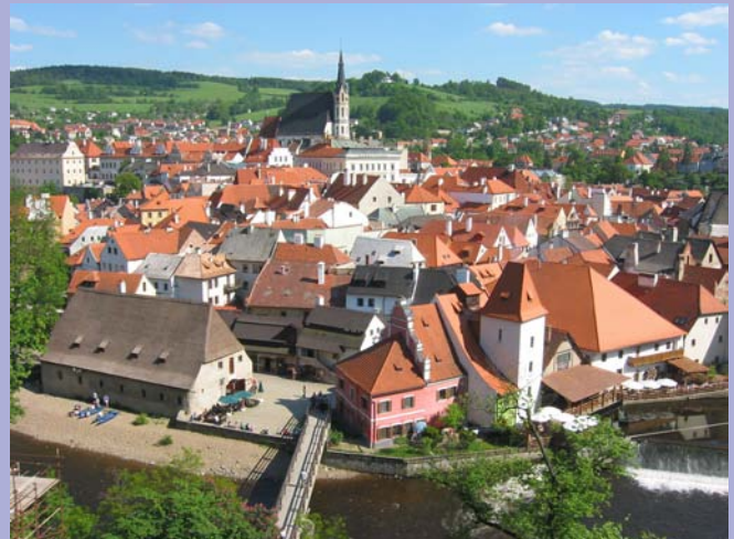
City of Český Krumlov - View from the Castle