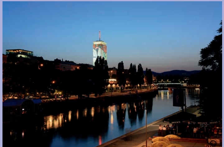
City of Vienna - Ringturm

petitions for referendums and in some countries referendums themselves. And if these measures prove impossible, mass demonstrations against the urban planning proposals occur. Dealing with citizens' initiatives becomes increasingly difficult when the organized protesters do not represent the public as a whole. It is quite often the case that they represent a conservative subgroup which is averse to contemporary architecture. Protests can be difficult to manage because they often lack credible spokespersons. Their sudden rise translates quite often to protesters not having all the facts, and the speed of protests is increased by the fast exchange of information through social media. Conserving a historic legacy does, however, place a high value on expertise and an awareness of the numerous criteria that go beyond a mere aesthetic evaluation. Even so, the public is basically aware of the concept of World Heritage and regards it positively. As such, the fundamental concept of World Heritage Cities must continually be communicated to the public, and as early as possible. It must be done with as much transparency as possible especially with regard to the processes involved. By doing so, understanding and appreciation can be created for the actions that must later be carried out.