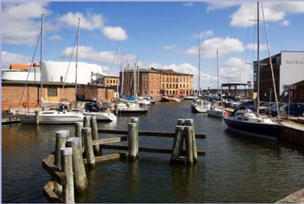
City of Stralsund - Harbour (© City of Stralsund)