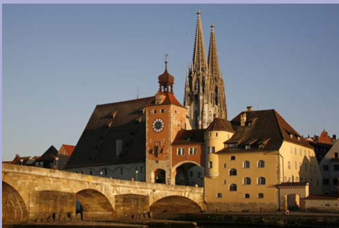
City of Regensburg