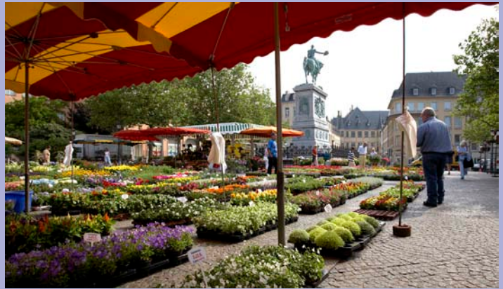
City of Luxembourg - Market on Place Guillaume II